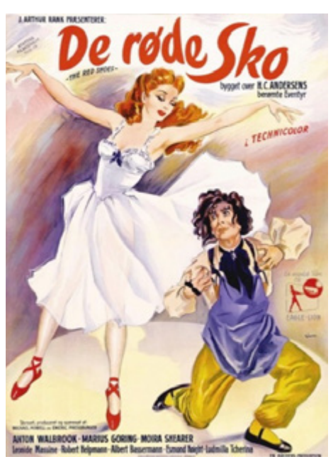
/ The Red Shoes original movie poster (Denmark)