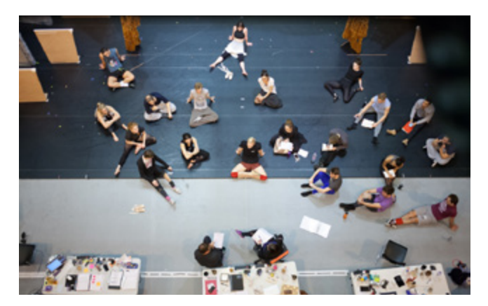
/ The Red Shoes company dancers researching their characters and reflecting during the creation period

For Bourne's production of The Red Shoes , videos were a huge source of primary research. Videos of the film's actors, famous ballet dancers of that time, videos of 1940s dance etiquette and portraits of prima ballerinas were all referred to. Once the dancers are cast the company enter a six-week rehearsal process leading up to the show's premiere performance. The dancers share and teach each other sections of choreography and, once learnt, Bourne can start to shape and refine the material and is very much like a film director during the choreographic process. He has to be responsible for not only polishing and improving individual scenes and performances but has to oversee the bigger picture and how these changes could affect the narrative.