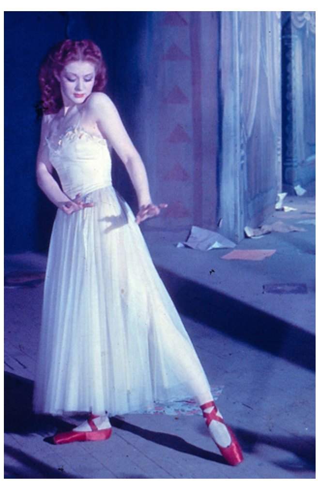
/ Moira Shearer as Vicky Page in the original 1948 film The Red Shoes

Matthew Bourne's production of The Red Shoes is heavily based on the award-winning film, however, there are some differences evident in the New Adventures production, which Bourne has made for artistic and narrative reasons.