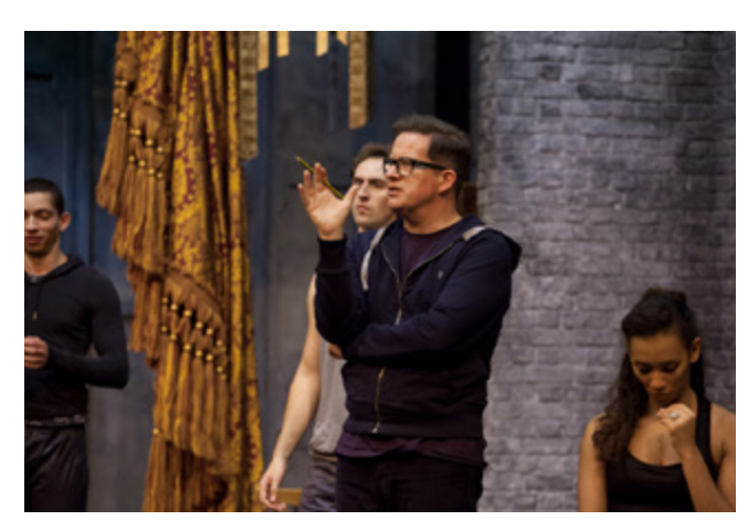
/ Matthew Bourne directing the New Adventures company during The Red Shoes creation period

Bourne himself would argue that it is difficult to describe his style because of the nature of his choreographic process. He is inspired by a plethora of stimuli, eras, dance styles and references. The movement content is deeply rooted in the background and context of the story. All movement is generated through intention-based tasks, creative exploration and play. In the context of The Red Shoes, romantic ballet and swing dance were predominantly used to help differentiate between Bourne's narrative and the various 'featured' ballets presented by Ballet Lermontov such as Les Sylphides and Lermontov's The Red Shoes Ballet. Social dances such as swing were used to develop phrases in order to portray Ballet Lermontov in a more relaxed state, for example as seen in the company's end of season party at the beginning of Act Two.