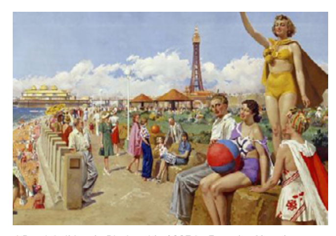
/ Beach holidays in Blackpool in 1937 by Fortunino Matania

N.B It is very useful to use images to add context to this task and build a mood board for inspiration. Find Pictures of beach life and the seaside of the 1930's