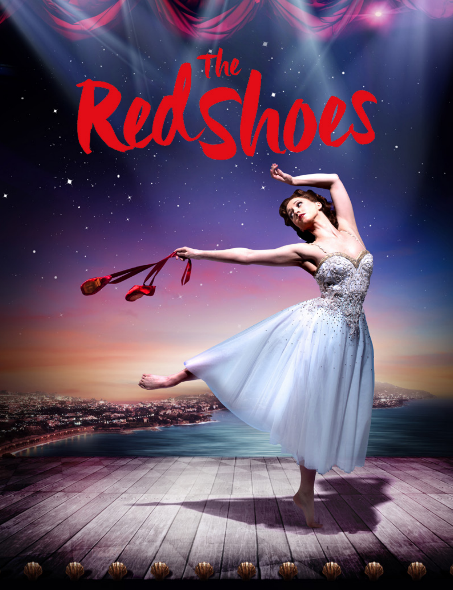
Student & Teacher Resource Pack