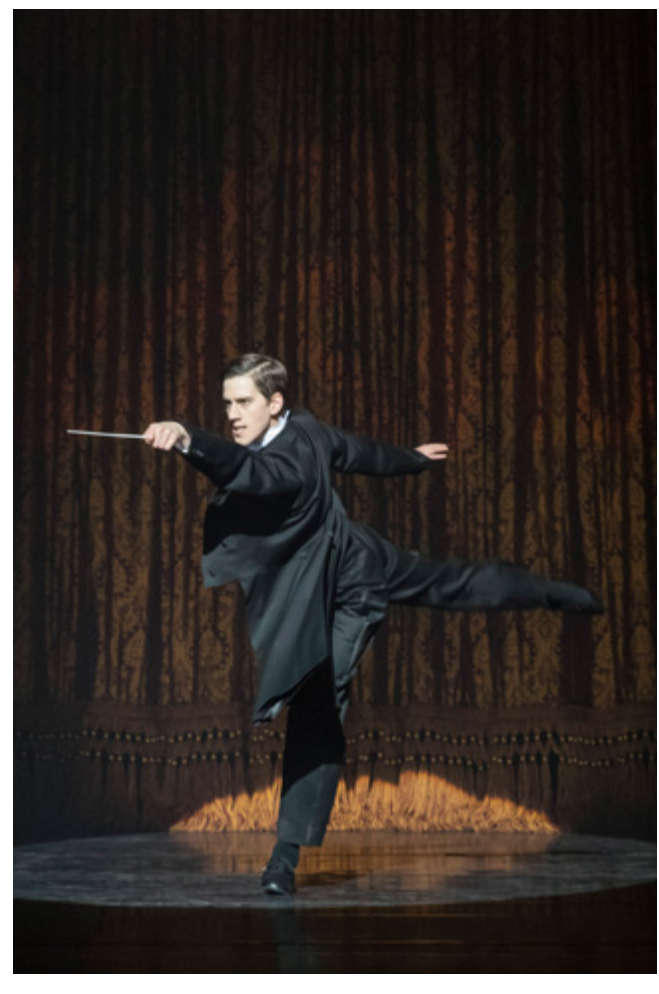
/ Dominic North as Julian Craster in The Red Shoes

Then, add in the idea of conducting an orchestra by conducting each letter to a different instrument or element of the orchestra. To increase the difficulty, you could develop the phrase by conducting the motif using different body parts.