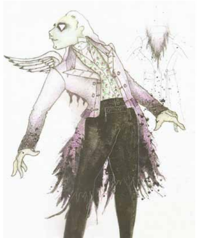
➤ Lilac Fairy Costume Design