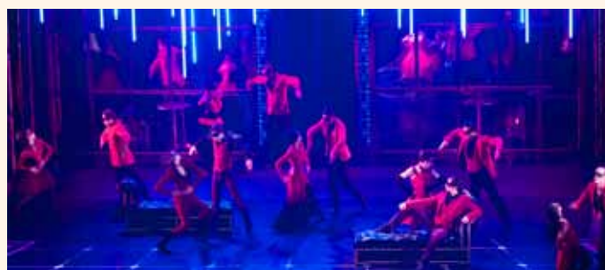
➤ Club Scene

Perform each scene to the rest of the group. Comment on the key themes explored, what stood out in each scene, how clear was each story (movement and character)?