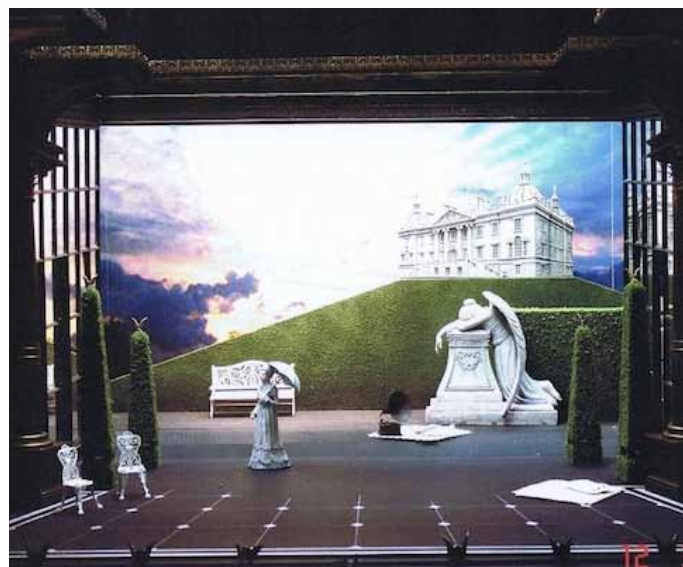
➤ Set Design

In Sleeping Beauty there are a few elements that New Adventures have not used before. Travelators (sections of floor which move) play an intrinsic part of the design, placed upstage on a slightly raised platform, two sections of floor move across the width of the