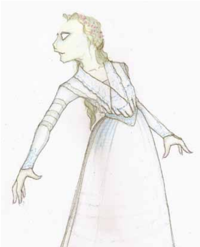
➤ Aurora Garden Party Costume Design