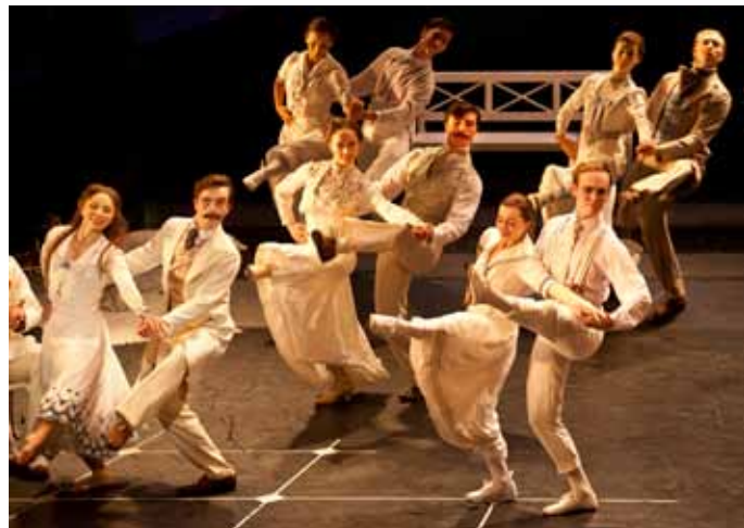
➤ Garden Party

The fairies are first seen travelling across the back of the stage in front of a moonlit backdrop. Each has a specific personality: Ardor the fairy of passion; Hiberna the fairy of rebirth; Autumnus the fairy of plenty; Feral the fairy of the untameable; Tantrum the fairy of temperament and the fairy king Count Lilac. Each fairy offers a gift and protection to Aurora before they exit. As Miss Maddox is tending to the baby Carabosse and her attendants enter, she feels the King and Queen haven't shown their gratitude to her for giving them a baby. After terrorising Miss Maddox and awakening the King and Queen, Carabosse briefly disappears only to return holding the baby Aurora. Carabosse starts to place a curse that will send Aurora into an endless sleep after she pricks her finger on a rose at her coming of age. Count Lilac intervenes as a grown up faceless Aurora acts out the curse and changes the curse to 100 years of sleep from which Aurora can only be awoken by the kiss of her true love (Leo, the palace gamekeeper). Act One comes to a close back in the baby Aurora's bedroom with Count Lilac and the fairies forming a protective circle around the baby princess, safely returned to her cot.