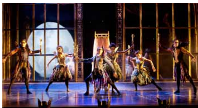
➤ Good Lighting