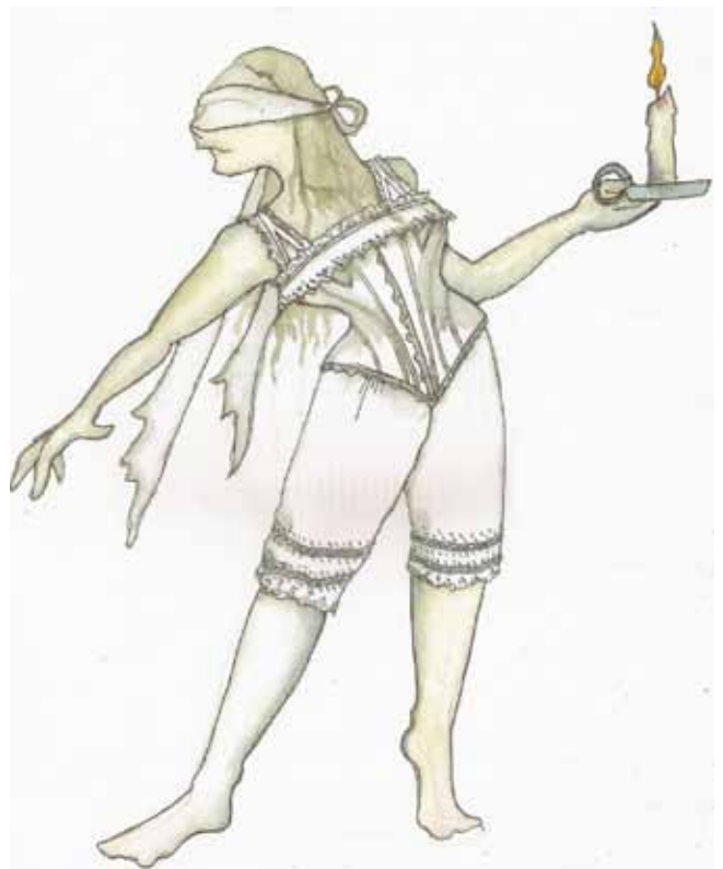
➤ Sleep Walker Costume Design