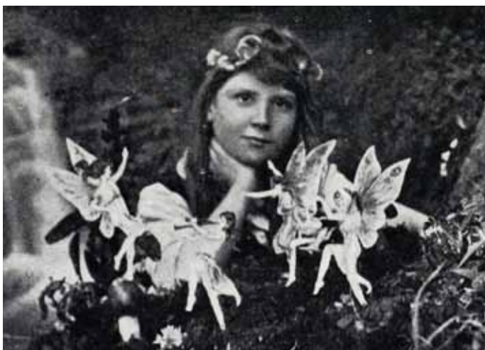
➤ Cottingly Fairies (1917)

Vampires have come back into vogue with TV series and films like Buffy the Vampire Slayer , The True Blood and Twilight Saga . Bourne drew on the True Blood series as an inspiration for the fairies as well as looking at a world where humans and non-humans live side by side.