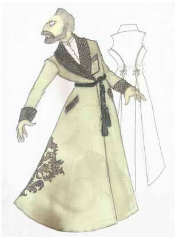
➤ King Nightgown Costume Design