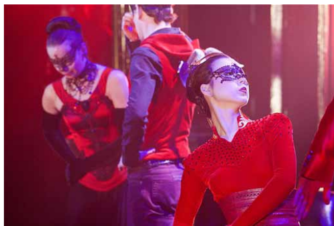
➤ Wedding Ensemble

The Palace is now a contemporary backdrop for the wedding between Caradoc and Aurora. The guests wear masks and are dressed in red creating a cult-like atmosphere. Aurora appears dressed in white a stark visual contrast to the guests. Leo and Count Lilac have infiltrated the wedding gathering in disguise and watch on as Caradoc shows off his bride to be. He lays Aurora on banquettes, as if she is about to be sacrificed and looms above her revealing his true self and drawing a dagger. Count Lilac appears behind Caradoc, garbs the dagger and plunges it into Caradoc's heart as Leo snatches Aurora away to safety. Aurora is still under Caradoc's spell but as Leo embraces and kisses her again she begins to awaken. She is momentarily confused and frightened but sees Leo and realises she is safe and with her true love. The spell has finally been broken. The lovers are guarded by the fairies as they lie in their leafy bed. In the final scene we see the fairies, Aurora and Leo, now parents themselves. Their baby has little wings and takes flight with a similar wilfulness and playfulness we'd seen in Aurora as a baby. As the curtain drops, the audience see a happy family-like photograph and the words "..... And they all lived happily ever after" projected onto a gauze.