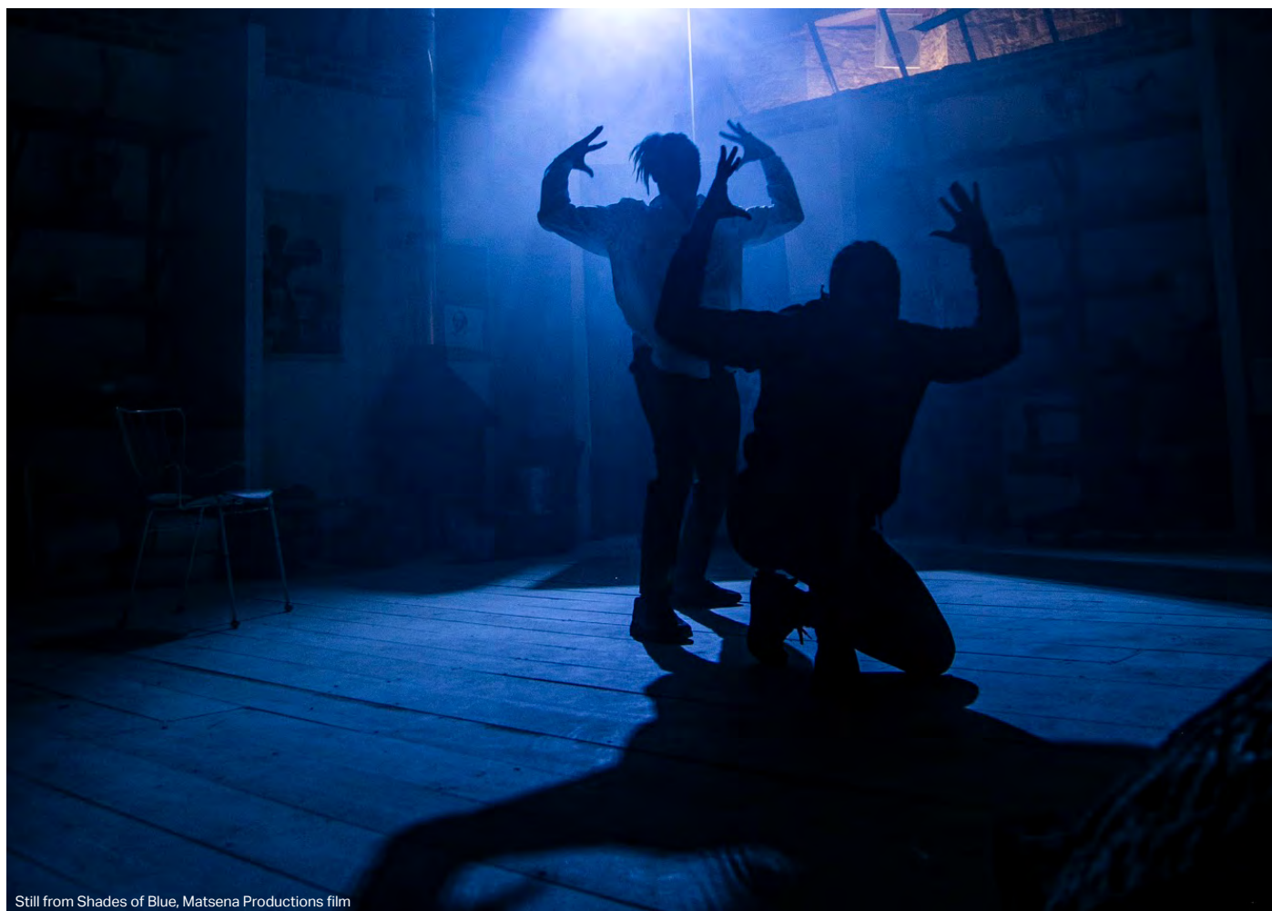
Still from Shades of Blue, Matsena Productions film

With thanks to Riverside Studios and Messums Wiltshire.