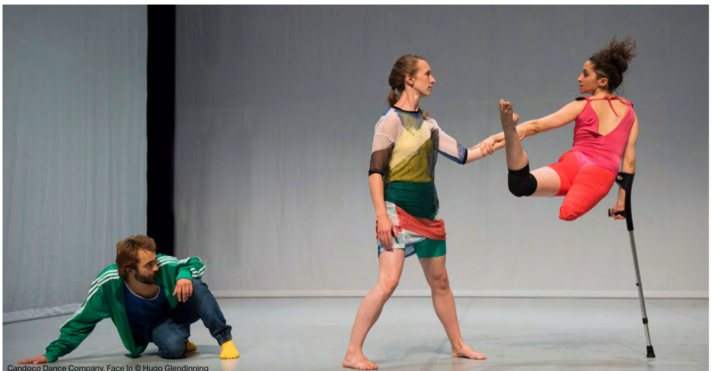
Candoco Dance Company, Face In

This piece is co-commissioned by: Festival Oriente Occidente and Trinity Laban Conservatoire of Music and Dance.