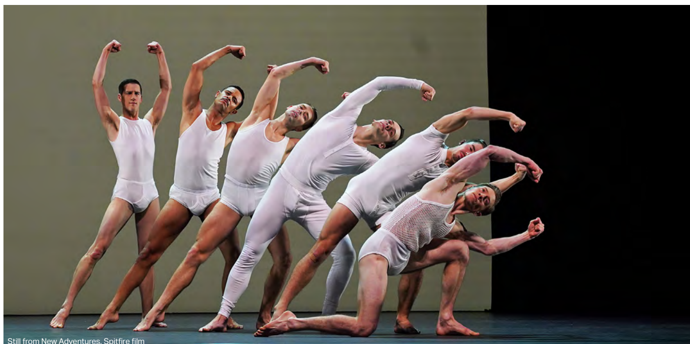
Still from New Adventures, Spitfire film