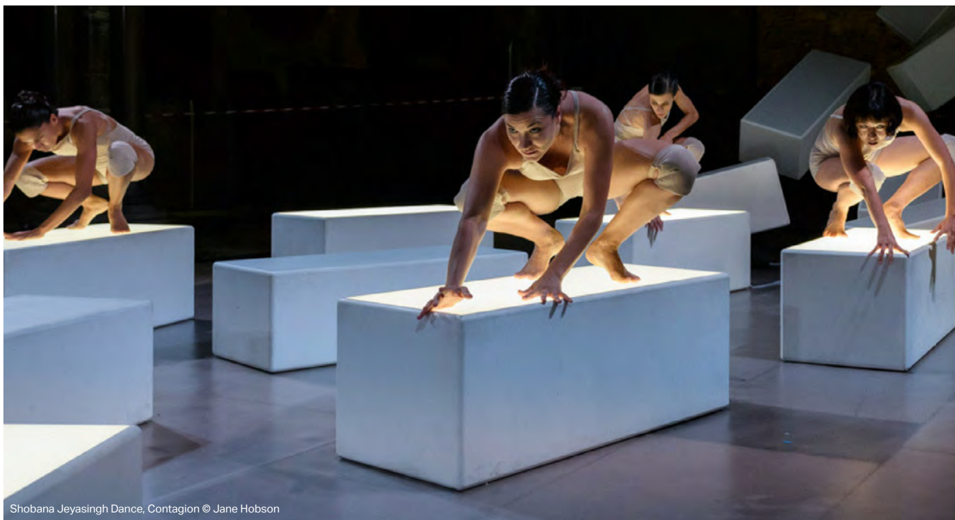
Shobana Jeyasingh Dance, Contagion