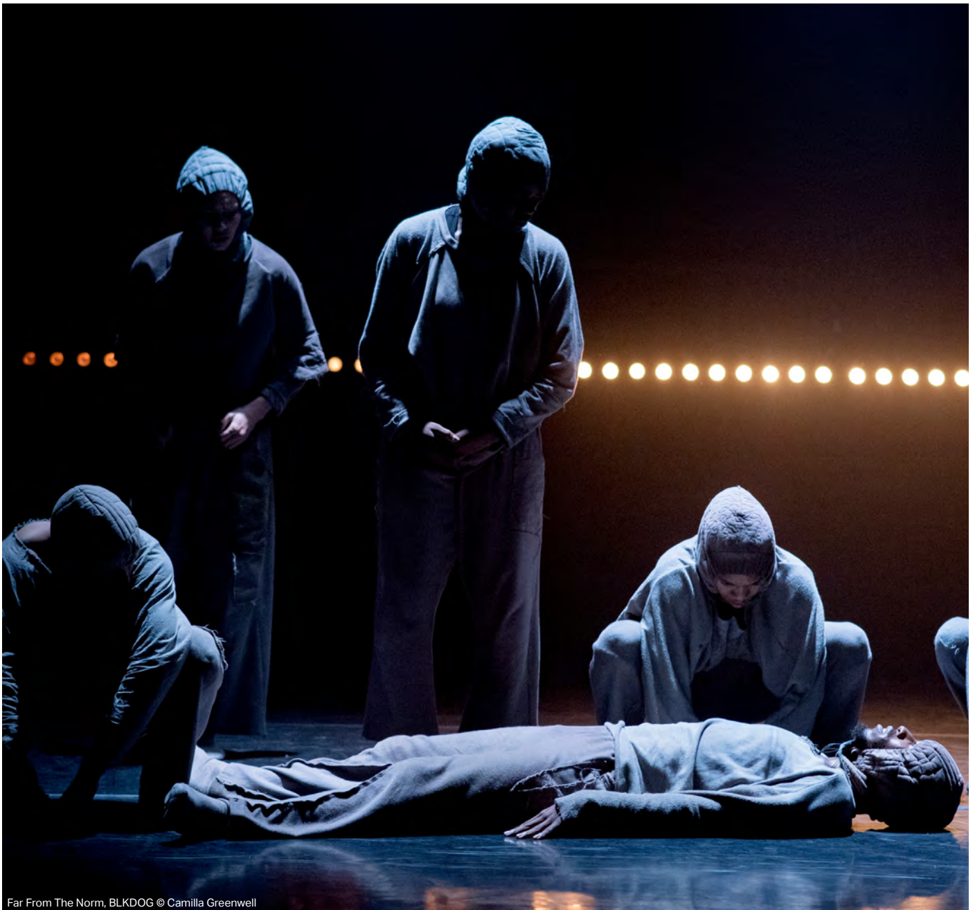
Far From The Norm, BLKDOG

BLKDOG is co-produced by Far From The Norm and Sadler's Wells and supported by Arts Council England.