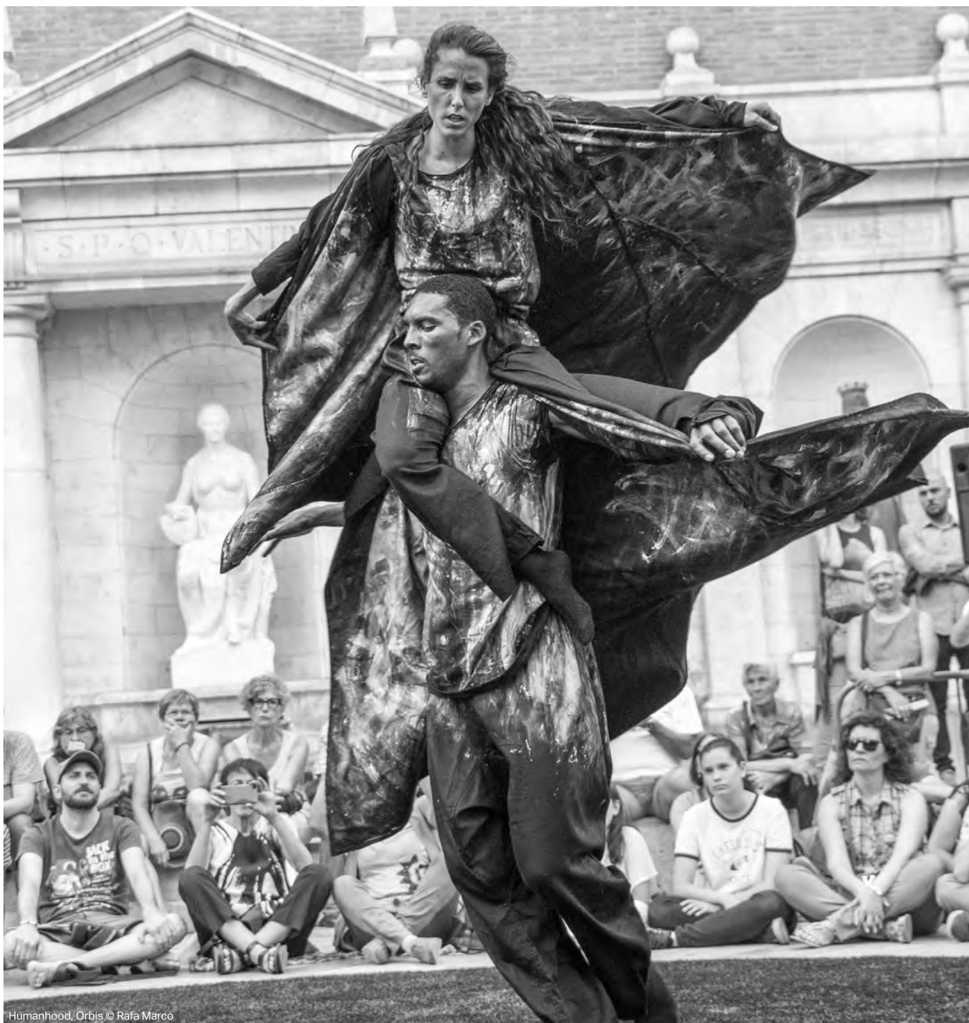
Humanhood, Orbis