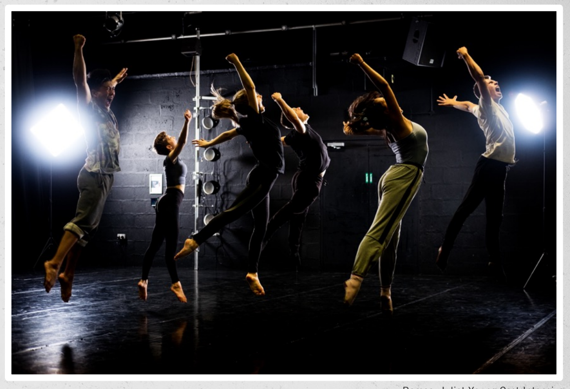
Romeo+Juliet Young Cast Intensive

Our work is a crucial mechanism for finding and nurturing the next generation of dancers, artists and audiences but is only possible due to the generosity and dedication of our supporters.