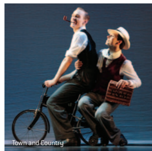
Town and Country