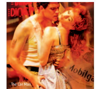
The Car Man