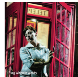
Play Without Words